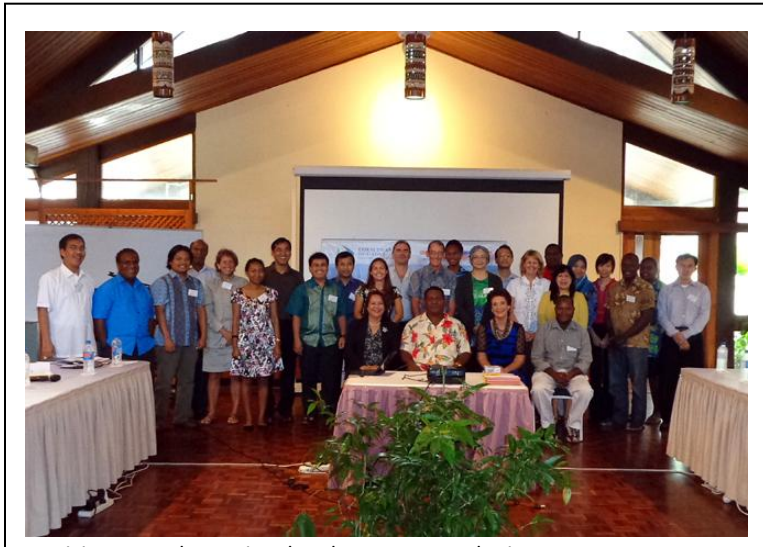
Participants at the Regional Exchange on Developing an MPA Management Effectiveness Protocol to Support the Coral Triangle MPA System, held on March 12-16, 2013, in Honiara, Guadalcanal, Solomon Islands.

The first REX(REXI) that looked at MPA network/system design and operations was held in Phuket,